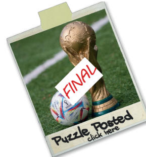
November 2022 Soccer World Cup