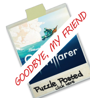
February 2022 Spiritfarer