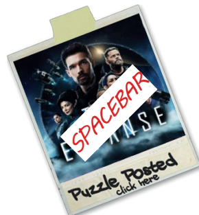
August 2022 The Expanse