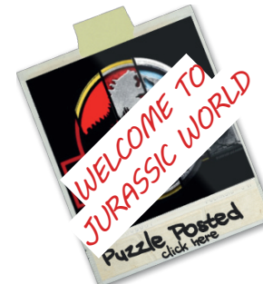
June 2022 Jurassic Park