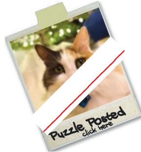
December 2022 Cats

In January I got my lean new tree. In February who saw me feign bad melody? Everyone. In March I promised to never prettify fountain photos. In April I did speed dating with a local family. "Next sis, sir." In May I met a man named Ego, who volts detergent. In June I saw sacred juice rooms went hollow. In July I went to visit the Kent Chapel setter. In August I found the best thing for a barge – whitecaps. In September I got my Greece console, Venus. In October I took time to find inner "Yes!" In November I kept my win afloat. In December I got a schnauzer, Firebug Poacher.