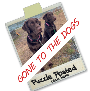
May 2022 Dogs