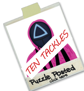
July 2022 Squid Game