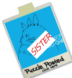
April 2022 Miyazaki