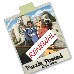
January 2022 Avatar