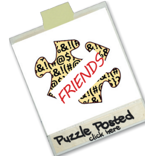
October 2022 Special Characters