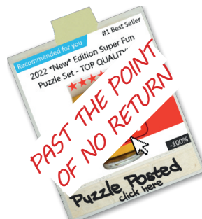
March 2022 Internet shopping