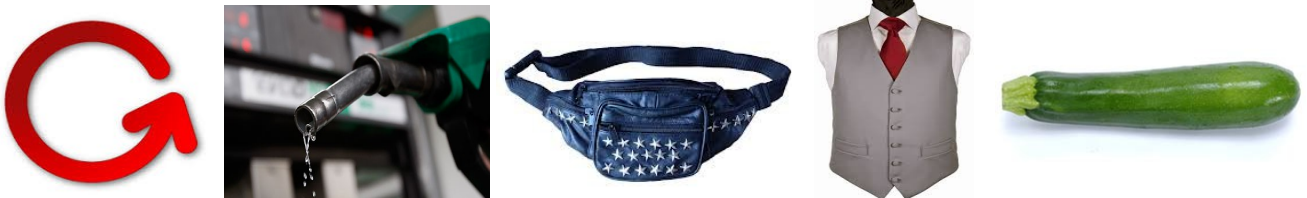
Anticlockwise / Counter Clockwise, Petrol / Gas, Bum Bag / Fanny Pack, Waistcoat / Vest, Courgette / Zucchini