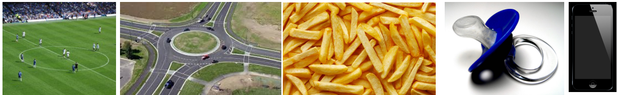
Football / Soccer, Roundabout / Traffic Circle, Chips / Fries, Dummy / Pacifier, Mobile / Cell

And, in great timing, this appeared in the UK news the day before Puzzled Pint... http://www.dailymail.co.uk/news/article-2537961/Couple-booked-bargain-flight-Birmingham-Caribbean-turned-away-ALABAMA.html