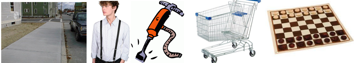
Pavement / Sidewalk, Braces / Suspenders, Pneumatic Drill / Jackhammer, Trolley / Cart, Draughts / Checkers