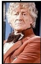
Third Doctor (Jon Pertwee, 1970-1974)

I've got an Ood feeling about this... _____