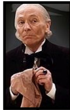
First Doctor (William Hartnell, 1963-1966)

Born on the planet Gallifrey, in the domed capital city from where the Time Lords preside. Died as his life force was pulled away by the planet Mondas.