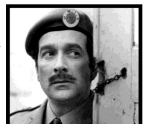
Companion Brigadier Lethbridge-Stewart Commander of the British contingent of U.N.I.T.

Question of the Month (write on the back):