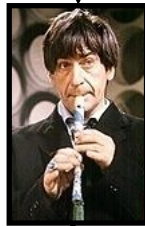
Second Doctor (Patrick Troughton, 1966-1969)

Executed by animated scarecrows as the Time Lords' punishment for stealing the T.A.R.D.I.S.