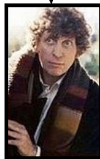
Fourth Doctor (Tom Baker 1974-1981)

Known for his unique and impracticably long scarf. Died falling from a great height.