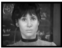
Companion Susan Foreman The Doctor's granddaughter