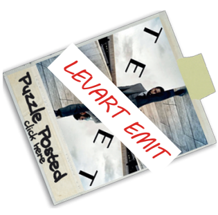
September 2021 Tenet