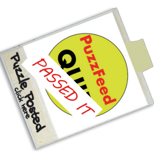
January 2021 Puzzlefeed