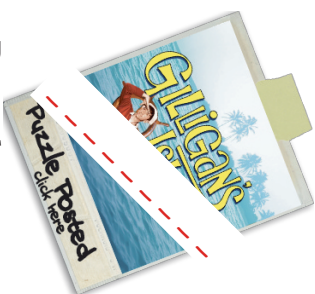
December 2021 Gulligan's Island

We encourage all listeners to report any information they may have regarding how we might ever see them again.