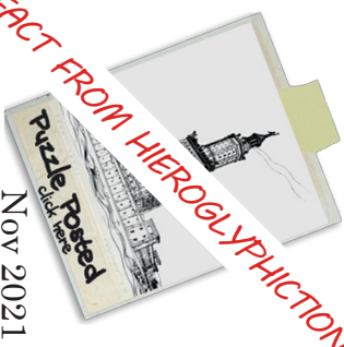
Nov 2021 Seven Wonders of the Ancient World