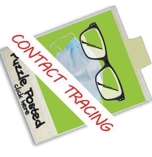
March 2021 Life in 2020