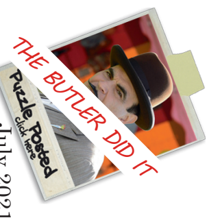
July 2021 Agatha Christie's Poirot