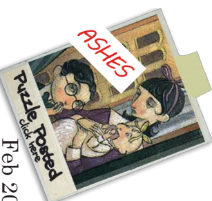
Feb 2021 A Series of Unfortunate Events