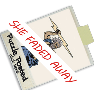
April 2021 Greek Mythology