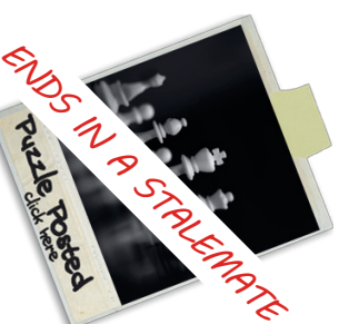
June 2021 Chess