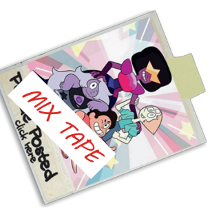
May 2021 Steven Universe