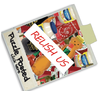
October 2021 Condiments