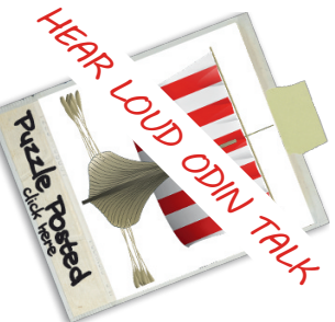
August 2021 Vikings