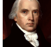
James Madison (1751-1836)

E ditor and author of the first draft of the Declaration of Independence, helped Lafayette draft his own declaration as Ambassador to France, served as the first Secretary of State and third POTUS.