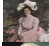
Angelica Schuyler (1756-1814)

I ntroduced to Alexander at a winter’s ball, married him, burned the letters, then spent the time after his death working to tell his story. Truly the best of wives and best of women.