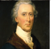
Hercules Mulligan (1740-1825)

K illed only weeks before the British withdrew at the end of the war, but before then dueled with Charles Lee and brought up the concept of having slaves fight in return for freedom.