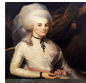
Elizabeth Schuyler (1757-1854)

C ome again? Joined the revolution to socially advance instead of just sewing pants; worked as a tailor’s apprentice while spying, smuggling information and measurements up to the Sons of Liberty.