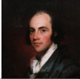
Aaron Burr (1756-1836)

B ooked passage on a ship that was New York bound and rose up to become Washington’s right hand man, the first secretary of the treasury, and the titular character of our story.