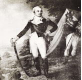
John Laurens (1754-1782)

O ui oui, mon ami! The Lancelot of the revolutionary set cut off the British at Chesapeake Bay and then worked with Jefferson to draft a declaration back in France.