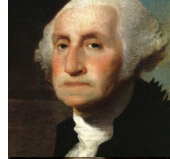
George Washington (1732-1799)

P resided as the oldest and the wittiest and the gossip of the Schuyler sisters; corresponded with Alexander, supported Eliza through her husband’s infidelity and later helped her to tell his story.