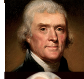
Thomas Jefferson (1743-1826)

H ere comes the general! The pride of Mount Vernon served as commander-in-chief, lead the United States against the British forces during the Revolutionary war, and served as the first POTUS.