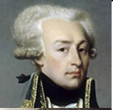
Marquis de Lafayette (1757-1834)

O riginally Hamilton’s friend turned enemy, talked less and smiled more in order to become senator of New York, third US Vice President, and the damned fool that shot Hamilton.